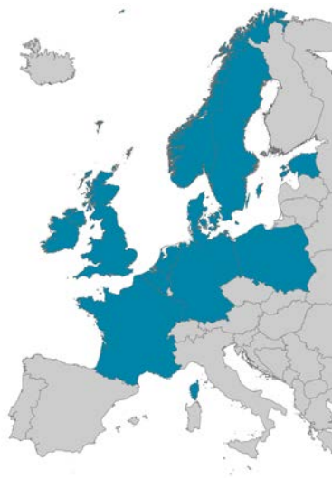
Figure 1. Countries that have experts in the WGMRED.

How these devices might affect the marine environment, locally, regionally and on larger spatial scales, is currently investigated by ecologists who are continuously improving their understanding of these effects. Following this necessity to ensure proper knowledge exchange between scientists, an ICES workshop “Effects of offshore wind farms on marine benthos” (WKEOMB, see ICES 2012) was initiated in 2012. The aim of this workshop was to increase scientific efficiency of offshore wind farm benthos research, to discuss the most actual results and to facilitate a closer international collaboration throughout the North Atlantic region. The workshop highlighted the importance of a regular knowledge exchange which lead to the establishment of the working group on marine benthos and renewable energy developments in 2013.