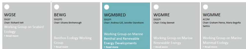
Figure 2. ICES groups closely linked to WGMRED.

All members of the group agreed that there is a need to mutually inform and work together with ICES groups that are closely related. The group is thematically linked to several other ICES working groups (Figure 2).