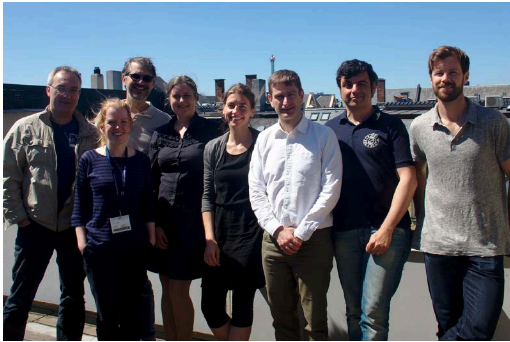
Participants at the 2017 WGMHM meeting at ICES HQ, Copenhagen, Denmark.