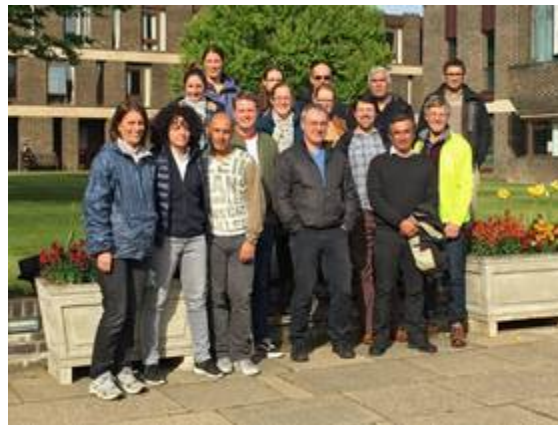
Figure 1. Most of the EMODnet Seabed Habitats phase III partners at the kick-off meeting in April 2017.

Seabed Habitats is one of seven themes under EMODnet; with its third phase beginning in May 2017, kicking-off with a meeting of the 12 partners (Figure 1) in Cambridge, UK.