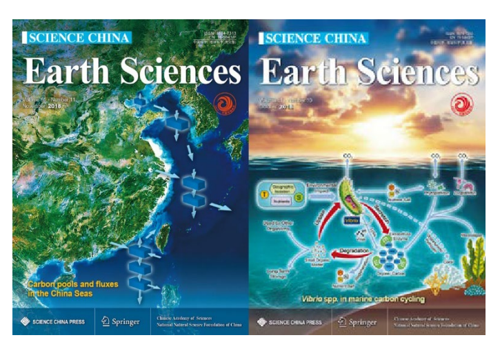
Figure 2. Cover images of two special topic sections in Science China Earth Science organized by WGCCBOCS.