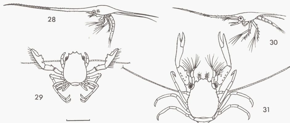
Figs. 28, 29. Porcellana platycheles : 28, zoeal stage I; 29, megalopa. – Figs. 30, 31. Pisidia longicornis : 30, zoeal stage I; 31, megalopa. Scale-line approximately 1 mm: Figs. 28–31.

[Figs. 1–3, 10 after Sars; 8, 15–23, 25–31 after Lebour; 9, 11–14 after Huus; 24 after Bull; 4–7 original R.B.P.].