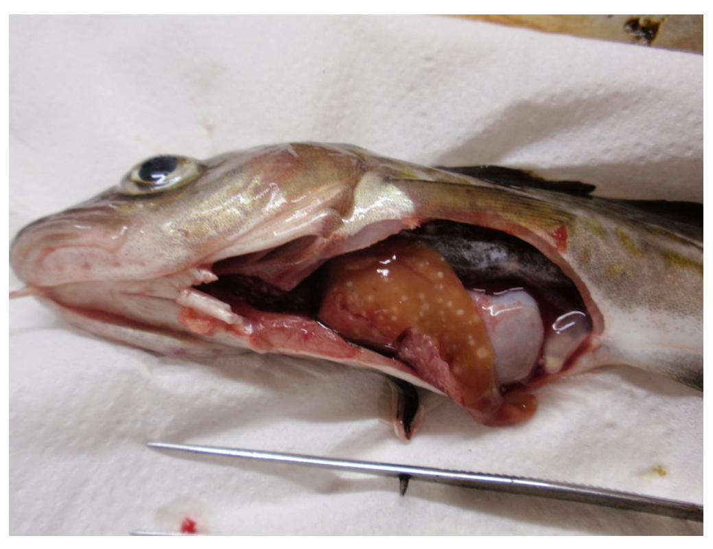
Figure 1. Gross clinical appearance of Atlantic cod, Gadus morhua , with francisellosis showing characteristic multiple granulomas (white spots) on the liver.