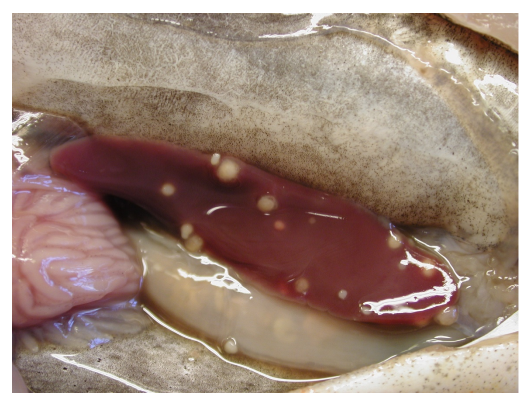
Figure 2. Close up from the caudal part of body cavity of wild Atlantic cod with francisellosis. Multiple granulomas (white spots) are seen in the spleen. Granulomas of various development stages can be observed in a range of organs/tissues: liver, kidney, spleen, skin, heart.

Figure 1. Gross clinical appearance of Atlantic cod, Gadus morhua , with francisellosis showing characteristic multiple granulomas (white spots) on the liver.