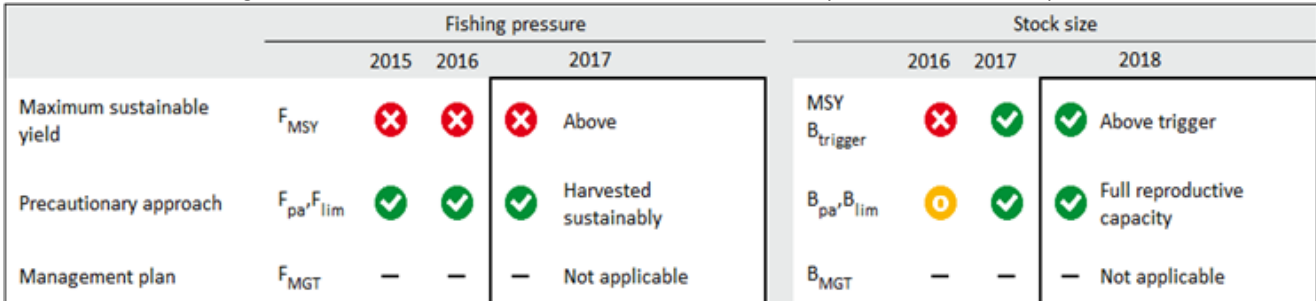
Table 1 Whiting in Subarea 4 and Division 7.d. State of the stock and fishery relative to reference points.