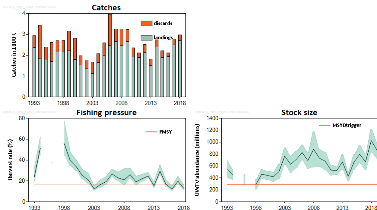
Figure 1 Norway lobster in Division 4.b, Functional Unit 8. Summary of the stock assessment. Long-term trends in catches, harvest rate, and underwater TV survey (UWTV) abundance (for animals greater than 17 mm carapace length); used as F and SSB proxies. Orange lines show proxies for MSY B_{trigger} and F_{MSY} . Shaded areas are 95% confidence intervals. Harvest rates prior to 2006 may be unreliable because of the underreporting of landings.

The stock size has been above MSY B_{trigger} for the entire time-series. The harvest rate is varying, and is now below F_{MSY} .