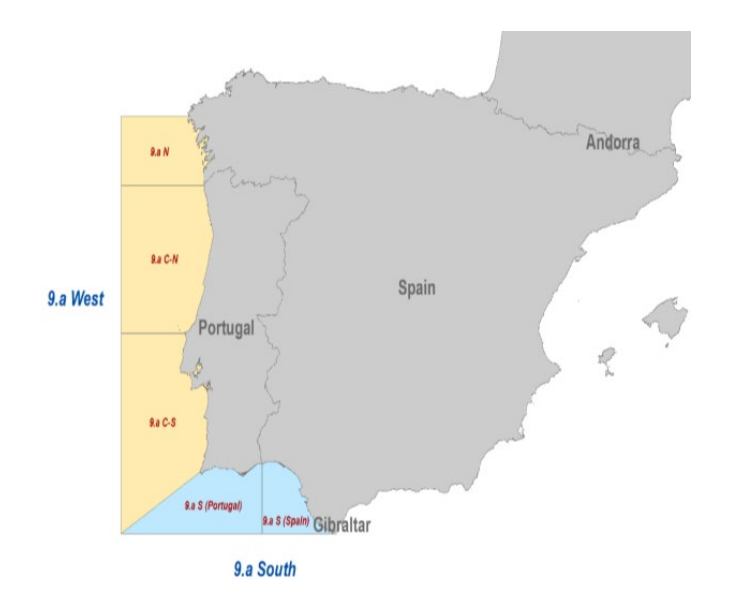
Figure 2Anchovy in Division 9.a and areas in the west and south of the Iberian Peninsula. "9.a West" refers to the western<br/>component in the geographical region including areas 9.a North, Central-North, and Central-South; "9.a South" refers<br/>to the southern component in areas 9.a South-Portugal and South-Spain.