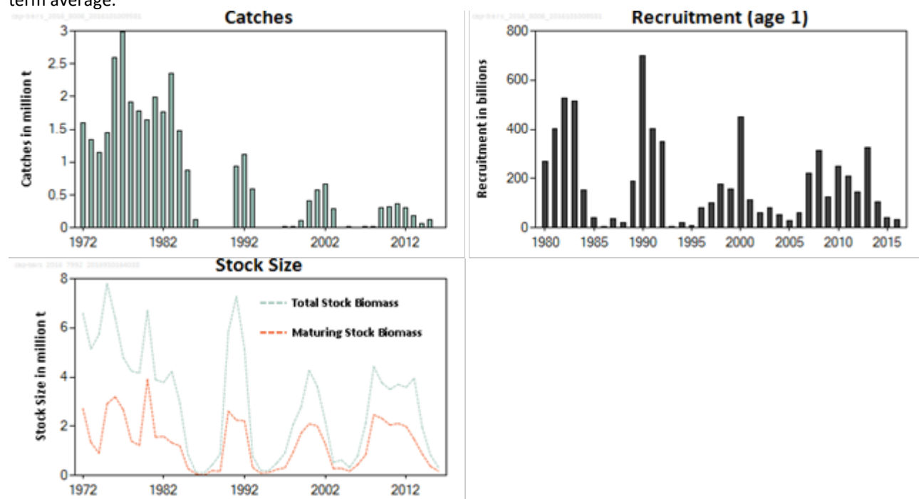
Figure 3.3.3.1 Capelin in subareas 1 and 2, excluding Division 2.a west of 5°W (Barents Sea capelin). Summary of stock assessment results for catch and stock biomass in millions of tonnes and recruitment abundance in billions of fish. Both the total and the maturing stock are estimated in October so the maturing biomass does not compare directly to the reference point ( B_{lim} ), which relates to SSB in April. The recruitment plot is shown only from 1980 onwards, as earlier survey estimates of age 1 capelin are unreliable.

The maturing component of the stock in autumn 2016 in the acoustic survey was estimated to be 181 000 tonnes. The estimate of the 2015 year class at age 1, during the survey in August–September 2016, was found to be well below the long-term average.