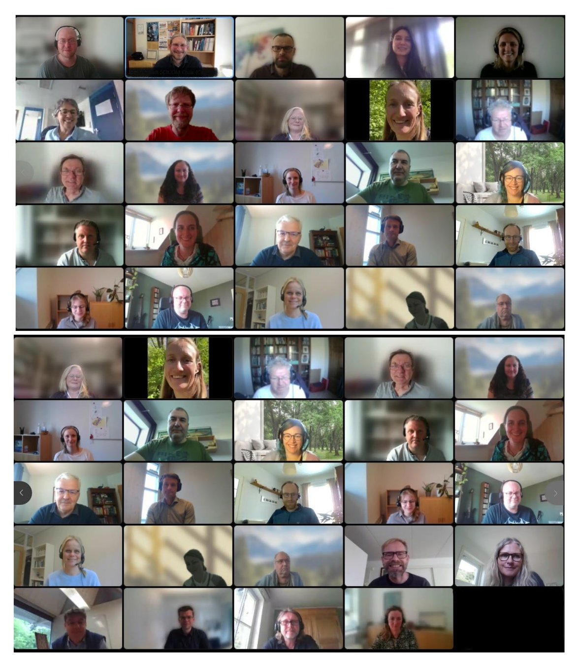
SCICOM Day 1