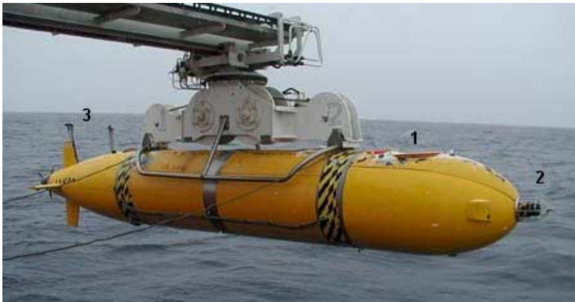
Figure 1. The AUV Autosub attached to its deployment cradle. The vehicle is 6.8 m long and 0.9 m in diameter. In this case two acoustic transducers (38 kHz and 120 kHz) are mounted on the dorsal side (1). The beacon (2) is for acoustic telemetry and the antennae at the rear (3) are for GPS, VHF, Argos and GSM communications.

AUVs are relatively small, self propelled, untethered, and unmanned vehicles, that can operate wholly underwater beyond the control and communication of any support facility. They are usually pre-programmed to conduct a variety of unattended underwater 'missions', and may be launched and recovered from the shore or at sea. They exist under a number of model-specific aliases and are sometimes also classed as untethered unmanned vehicles or unmanned undersea vehicles (both UUV). Typically they are torpedo shaped of the order of 2-10 m in length and 0.2-1.3 m in diameter. The UK's Autosub (Fig. 1) is typical of the design of many AUVs. Most of the payload space is taken up with the propulsion energy source and command and control instrumentation, which, naturally, need waterproofing in housings which vary in